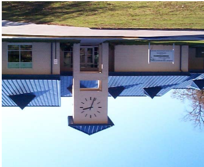
McClure Early Childhood Center